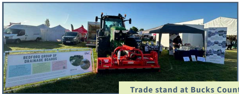
Trade stand at Bucks County Show 2024

We look forward to welcoming you onto our stand.