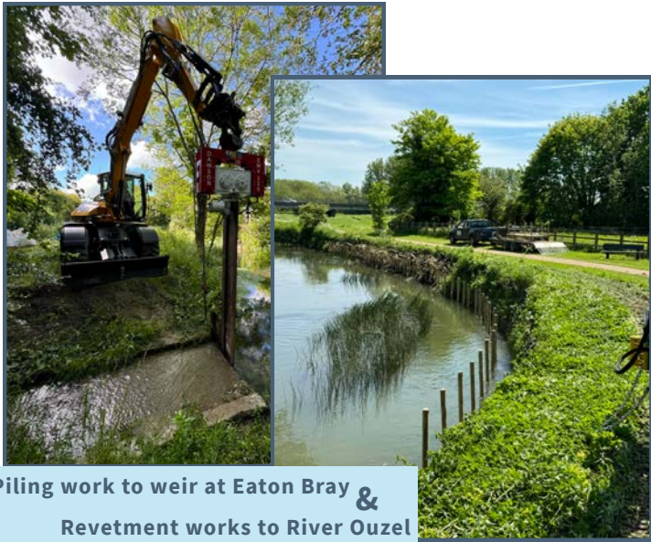
Piling work to weir at Eaton Bray & Revetment works to River Ouzel