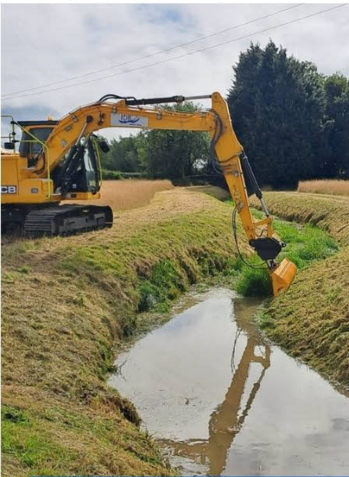
Weed Removal - September 2025