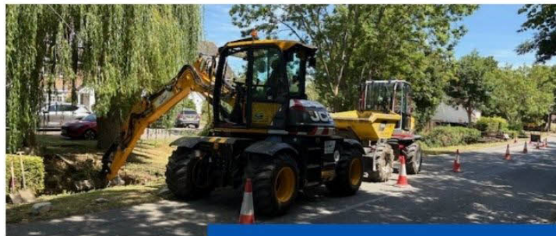
Works at Great Barford - July 2025

www.gov.uk/guidance/owning-a-watercourse